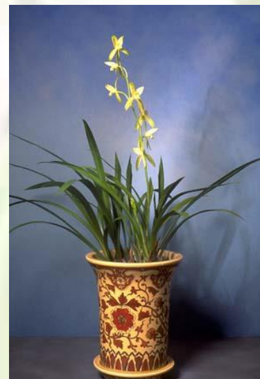
Cymbidium ensifolium produces delicate flowers with a delightful citrus fragrance.

One can almost hear a sigh of relief from all of the cool-growers, from masdevallias to odontoglossums. As day temperatures decline, one can see a noticeable improvement in these plants. Shorter days and lower light levels do not seem to bother them. Repot before winter arrives.